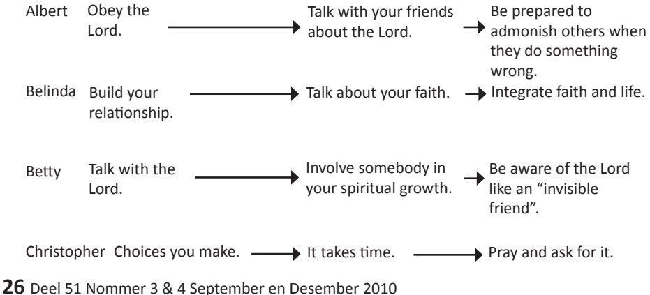
Figure 2: Semioses of spiritual growth

With each of the adolescents, semioses of the concept "spiritual growth" was evident. It is illustrated in Figure 2.