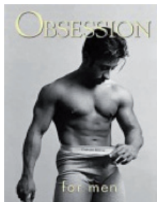
Illustration 1 17

The mass media thus create artificial standards against which boys (and men) as well as girls (and women) measure themselves and others. According to Kimmel & Messner (2004:505): 'Virtually no men can approach the physiques of the cartoon version of Tarzan or even G.I. Joe... No wonder we often feel like we fail the test of physical manhood. We are constantly 'seeing' masculinity, in the movies, in commercials, in pornography etc. Any effort to understand – let alone transform – masculinity must take account of the ways in which we see ourselves reflected through the lenses that record our fantasy lives.' (e.g. see illustration 1 here below)